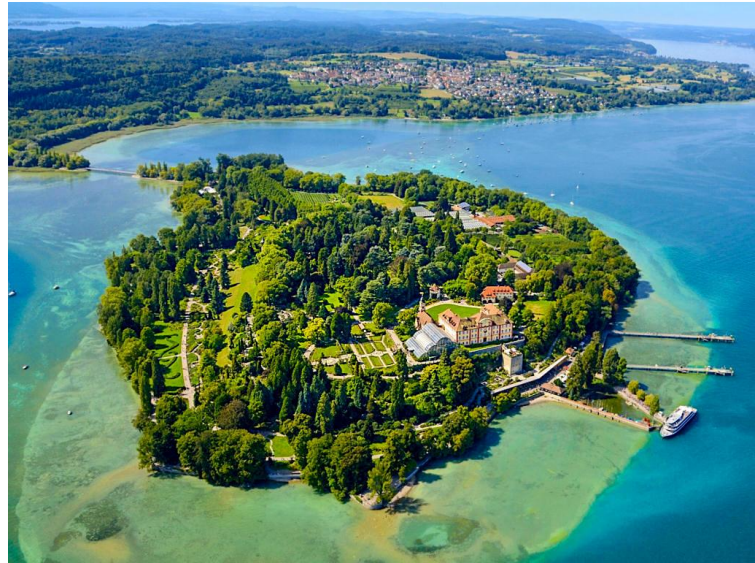
Insel Mainau ("flower island")