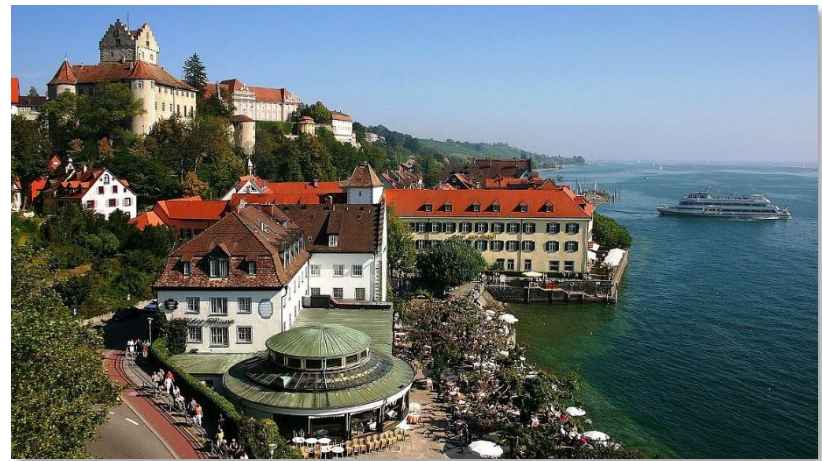
Meersburg (free ferry crossing with the students card!*)