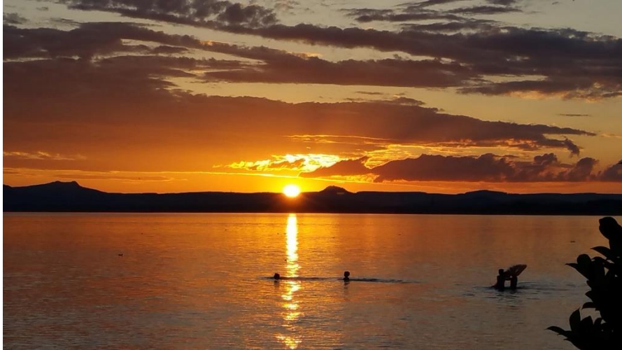
Sunset at the island of Reichenau (World Heritage Side)