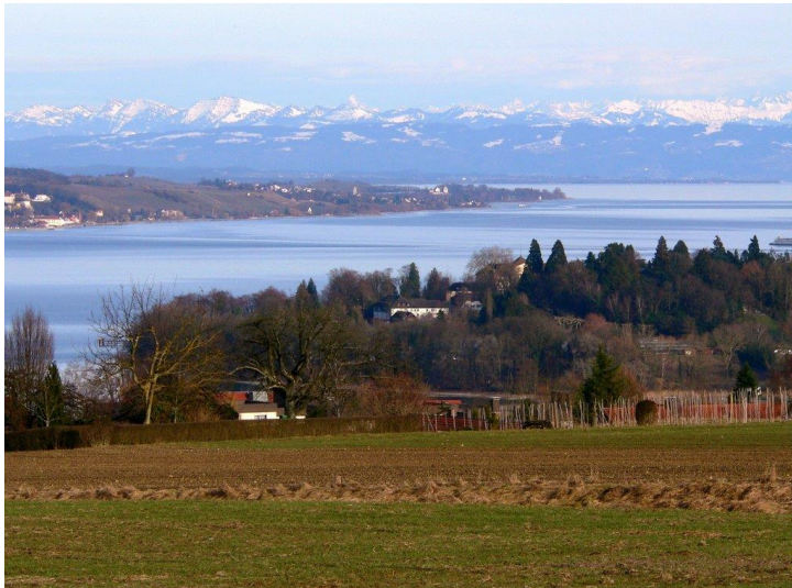
Purren in Litzelstetten