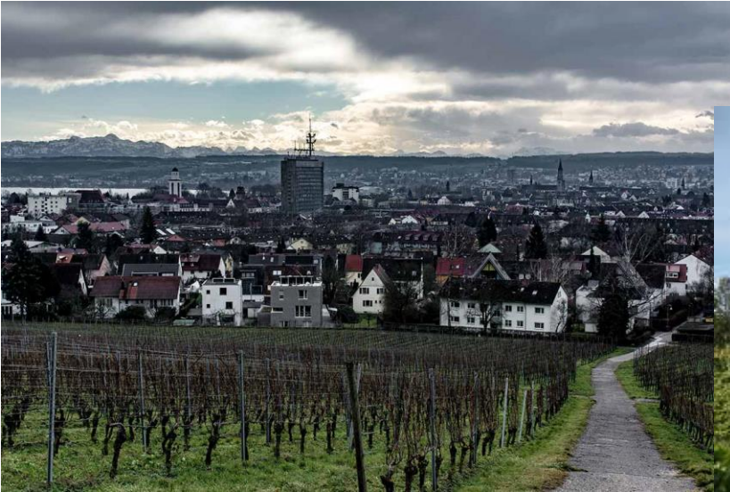
Bismarkturm in Petershausen